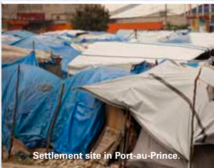
Settlement site in Port-au-Prince.