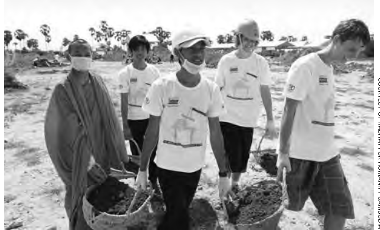
A monk studying at Phnom Penh's Pannasastra University, one of Habitat Cambodia's partner universities, works with volunteers wearing the official Habitat Youth BUILD T-shirt. The shirt's design was created by a Cambodian student and selected by regional online voting.

Habitat Cambodia also had to reduce the volunteer registration fee by about half to encourage more young volunteers to sign up. At the same time, the project team