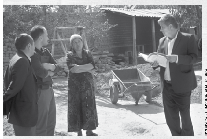
An IMON loan officer visits a family as part of the Habitat Tajikistan and IMON Tajikistan home improvement loan project.

Since Habitat for Humanity Tajikistan began operating in 1999, its work has ranged from new house construction to completion of half-finished buildings, renovation of apartment blocks, and provision of water