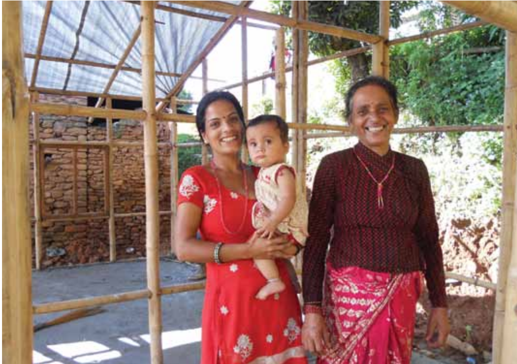
MAHADEV'S WIFE, DAUGHTER AND MOTHER