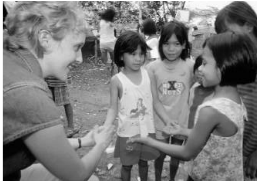
INTERNATIONAL PARTNERS DEDICATE THREE YEARS OF SERVICE OVERSEAS, WORKING TO DEVELOP AFFILIATES AND INCREASE HOUSE-BUILDING EFFORTS.

HFHI's Gifts-In-Kind department works with generous partners all over the world who supply such needed goods as windows, doors, siding, tools,