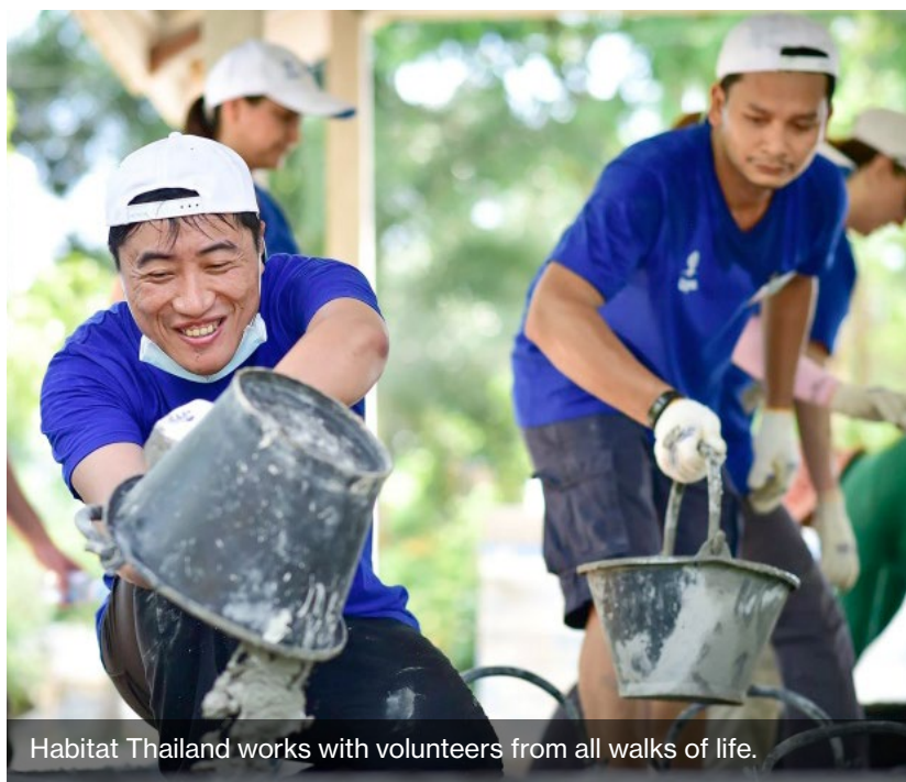
Habitat Thailand works with volunteers from all walks of life.

Habitat for Humanity Thailand works with donors and volunteers in providing affordable housing solutions. Corporate partners include Korean Reinsurance, Destination Asia, Thrivent, Bain & Company, Dow, HMC Polymer, Cargill, Ananda Development, Siam Commercial Bank, Seagate, Caterpillar, Nissan, Cigna, Bank of America, P&G and HSBC. International schools and universities also lend a hand.