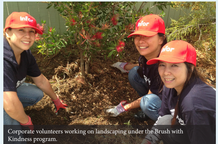
Corporate volunteers working on landscaping under the Brush with Kindness program.