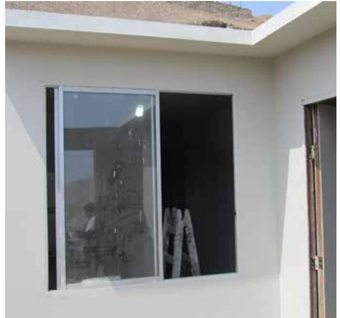
A house in process of improvement.

The CISF team brought a clear methodology to the project: a systematic process consisting of four stages.