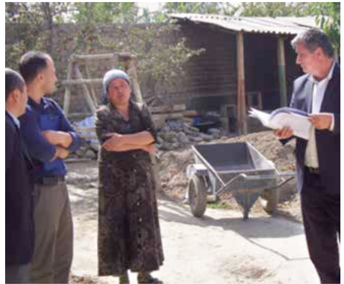
A housing microfinance client in Tajikistan speaks with personnel from IMON International.

This case study presents key lessons arising from the partnership between Habitat for Humanity Tajikistan and IMON International LLC Tajikistan. Specifically, it addresses lessons from a pilot project that delivered holistic