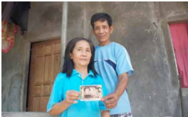
This family finished their home thanks to a loan from TSPI.

The strength of TSPI's housing product starts with careful attention and consideration to product development. Senior management identified a product champion who oversaw the product development process. This person managed the internal process of bringing all the branch staff and management on board and ensuring the systems, policies and procedures facilitated the rollout of the new product. Staff at all levels were closely consulted throughout the process — not just selling the idea of housing but walking alongside — otherwise there would not have been internal buy-in.