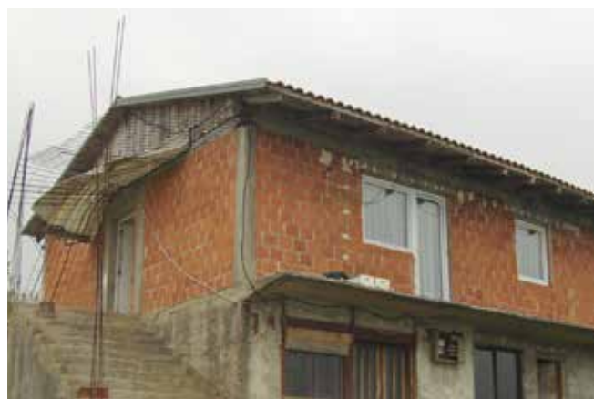
This house is in the process of being improved.

Both project partners are committed to scaling up the housing microfinance products developed in this pilot project. The experience highlighted a clear demand for housing microfinance, along with the potential for sustainable delivery. At the moment, housing loans represent 6 percent of LOK's overall portfolio, and LOK is committed