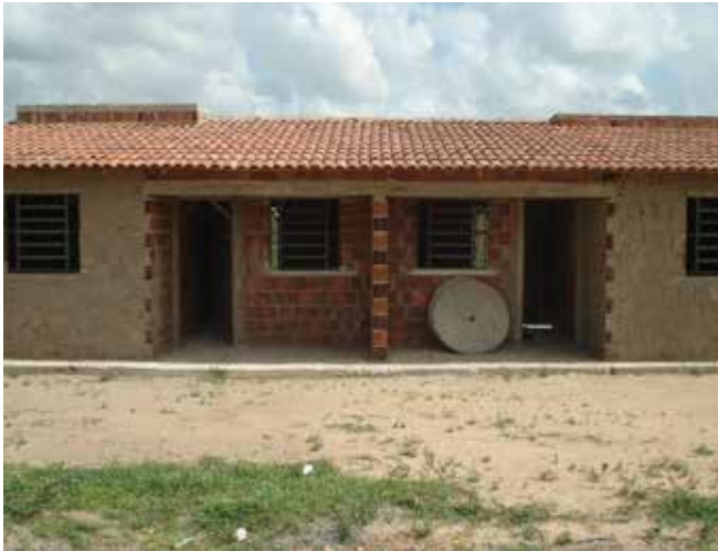
A house renovated with a housing microfinance loan.