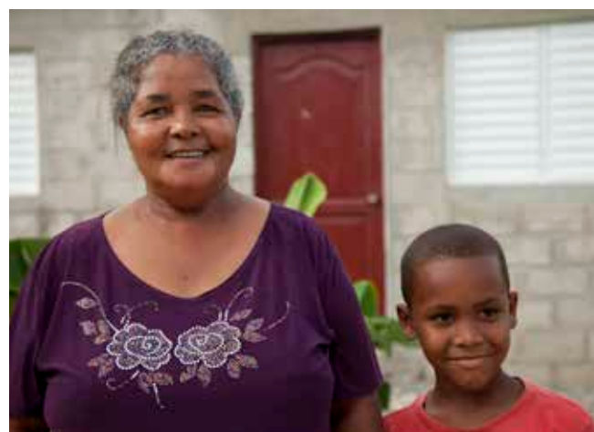
This woman and her grandson live in a house that was improved through a housing microfinance loan.