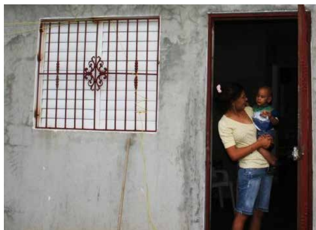
This woman's house was improved thanks to a housing microfinance loan.

Values: Efficiency, solidarity, perseverance, commitment, respect for human life, being service-oriented, providing quality service, creativity, adaptability, empathy, honesty and high performance.