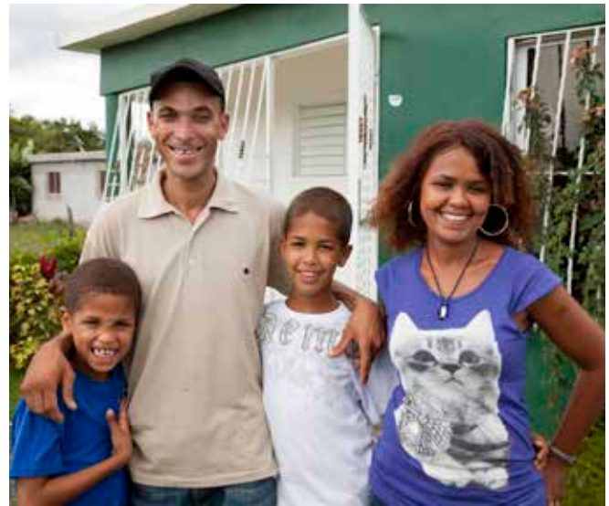
HABITAT FOR HUMANITY DOMINICAN REPUBLIC

This family in the Dominican Republic improved their house through a housing microfinance loan.