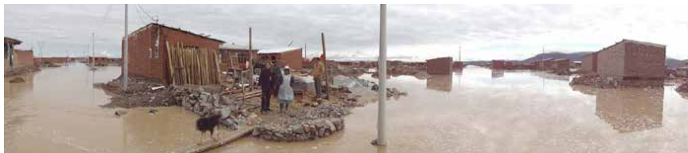
A CISF team member visits a community that is starting to receive housing microfinance loans.