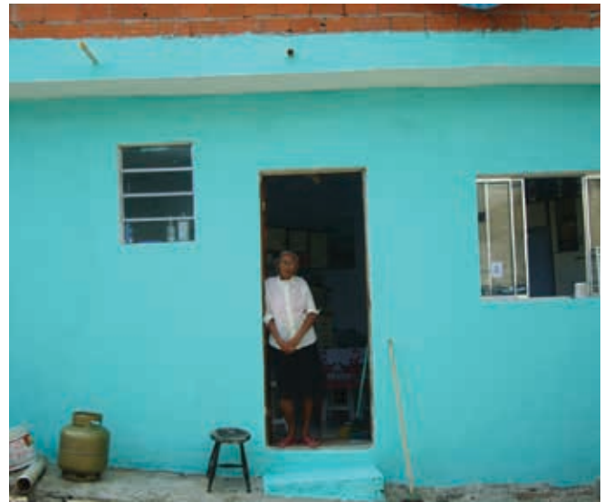
A woman in front of her improved house.