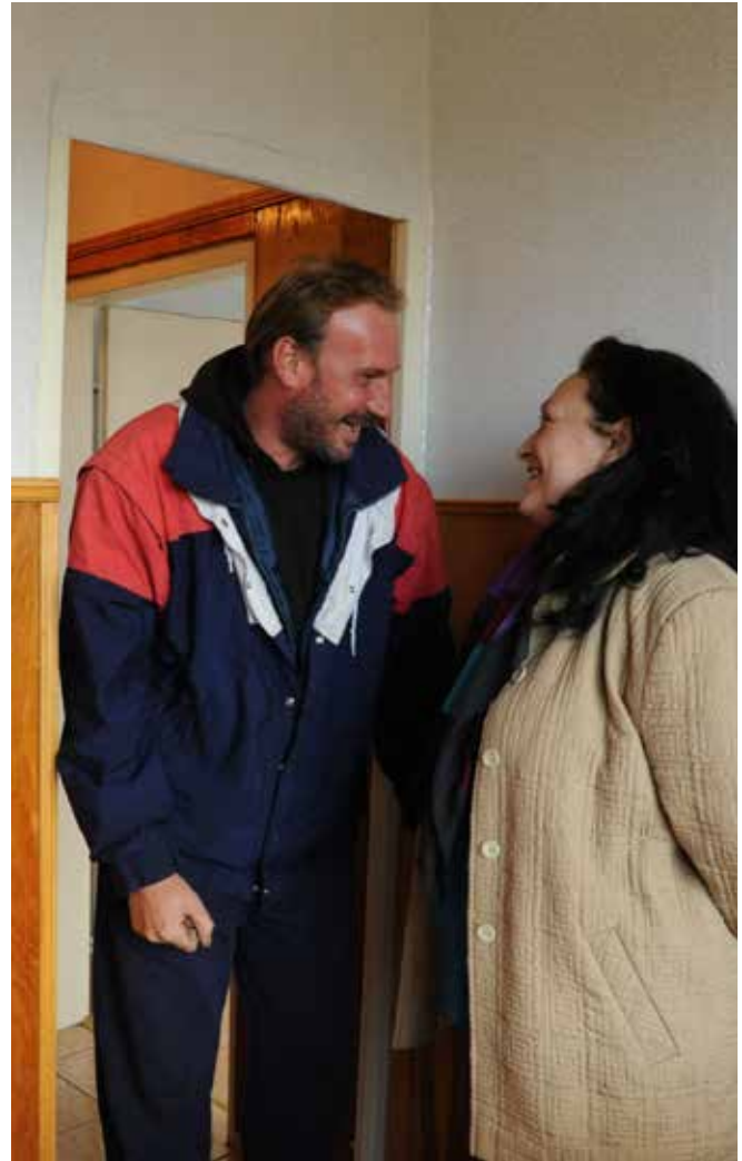
This family is enjoying their recently renewed home.

Still, many low-income households do not qualify for bank loans because of a lack of regular income or necessary documentation. Others use loans from consumer lenders for housing improvement and renovation purposes, although no specific research has been done in regard to what portion of consumer lending is spent on housing or energy efficiency needs. Some of the consumer lending companies in Bulgaria have an APR as high as 1,000 percent, but clients still approach these lenders because they value their extremely speedy service (some lenders are providing loans in just a couple of hours). Often, consumers are not even aware of the total price they pay for the loan. On one hand, such demand for fast loans indicates lower levels of financial literacy and a reactive approach among Bulgarian customers, who rarely consider the effect of the high-price loans on their family budget and do not research more affordable options, instead preferring an immediate service with a higher price. On the other hand, it is an indicator of the existing demand for consumer finance, including demand for housing loans.