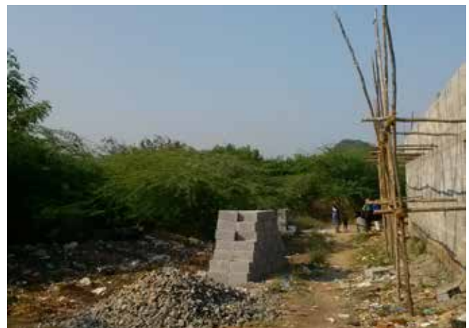
Growing Opportunity is extending housing microfinance loans in this community.

The technical visit helps clients by using a technical assessment sheet to assess the existing housing condition, the proposed housing improvements and the estimated