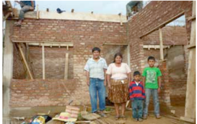
Table 1: Housing product performance indicators (October 2012)

This family in Bolivia is getting help building their house through a housing microfinance loan.