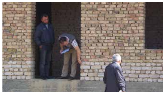
A construction technician visits one of IMON’s housing microfinance clients.