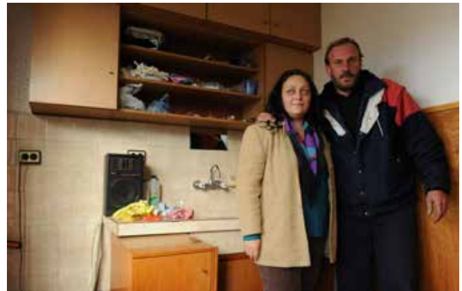
This family received a housing microfinance loan from Mikrofond.

Habitat for Humanity Bulgaria is a national organization of Habitat for Humanity International. Since 2001, it has helped more than 1,300 families in Bulgaria. The organization works with low-income families and disadvantaged and vulnerable people to improve their housing situation. Habitat Bulgaria currently is engaged in various projects addressing poverty and child neglect, residential energy efficiency in condominium buildings, financial literacy programs for low-income families, and plans to build new homes in partnership with poor households in one town.