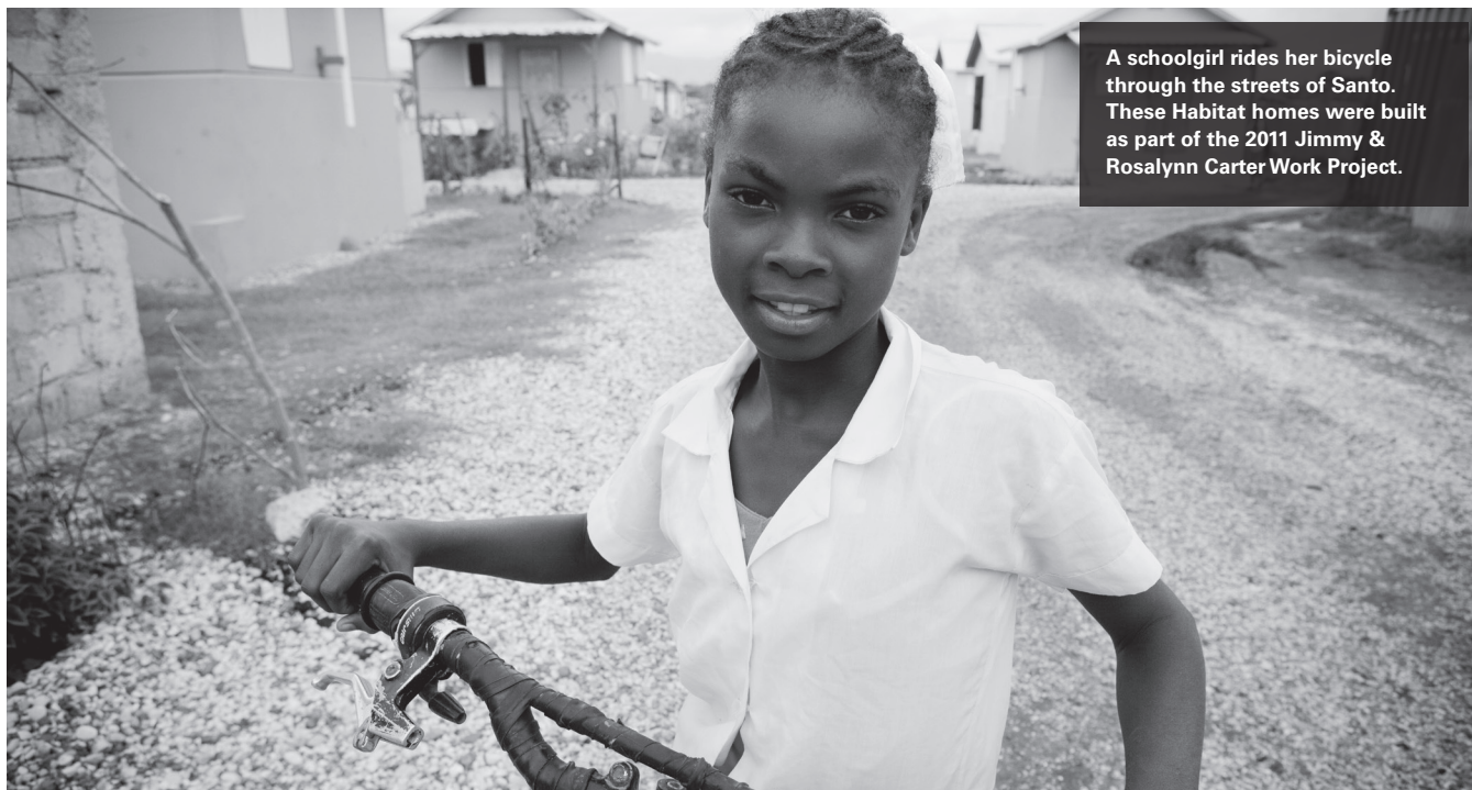
A schoolgirl rides her bicycle through the streets of Santo. These Habitat homes were built as part of the 2011 Jimmy & Rosalynn Carter Work Project.