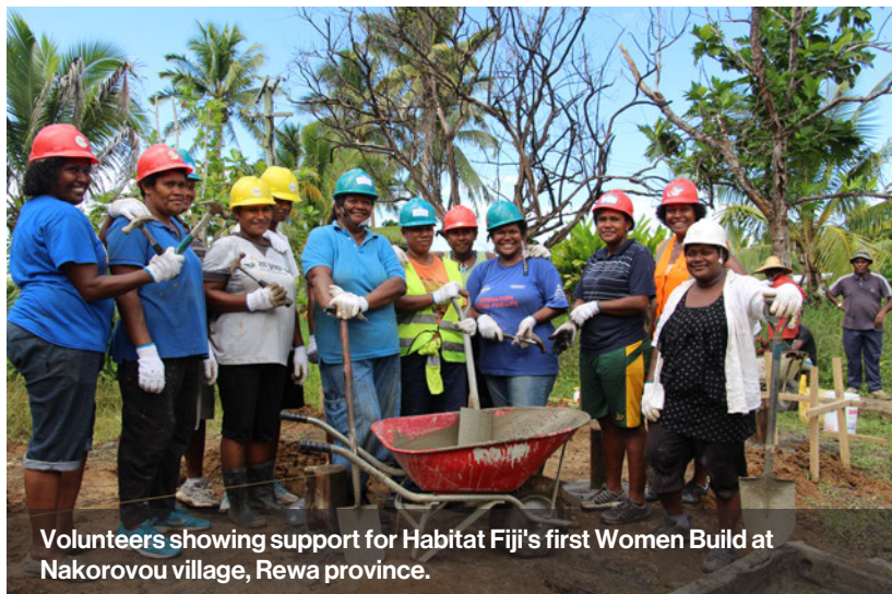
Volunteers showing support for Habitat Fiji's first Women Build at Nakorovou village, Rewa province.

Habitat for Humanity's activities in Fiji range from new house construction to helping families rebuild after cyclones and other disasters to improving water and sanitation access in various communities. Habitat homes are typically built with a combination of locally supplied timber, concrete, and metal roofing. Low-income families contribute their own labor to build their new homes.