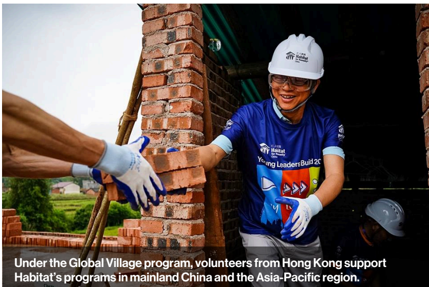
Under the Global Village program, volunteers from Hong Kong support Habitat's programs in mainland China and the Asia-Pacific region.

Habitat for Humanity Hong Kong, mobilizes individual volunteers, schools and corporations to help renovate the homes of low-income families, older persons and people living with disabilities in Hong Kong through Project Home Works. In partnership with local social service nongovernmental organizations, we identify families most in need, secure sponsorship from partners to fund the renovations, and recruit volunteers to carry out the work. Our Project Home Works supporting partners include corporations, churches, clubs, associations, schools and universities. For Project School Works, together with our corporate partners, we provide mural painting and run activities to highlight housing issues and discuss solutions with students in some of Hong Kong's most underserved areas. A transformed school environment encourages school attendance and improves the learning of children in low-income districts. We also raise awareness of housing issues including the living conditions of low-income families in public housing through social media, direct mail, street fundraisers and community engagement events.