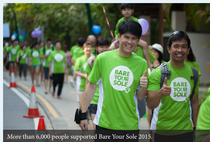
More than 6,000 people supported Bare Your Sole 2015.