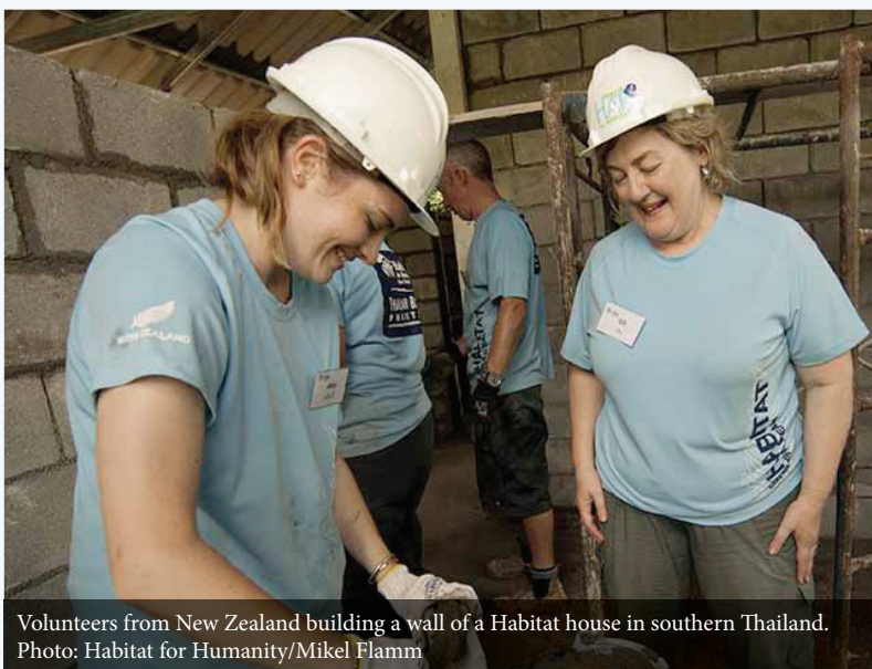
Volunteers from New Zealand building a wall of a Habitat house in southern Thailand.

Habitat for Humanity Thailand works with donors and volunteers in providing affordable housing solutions. Corporate partners include Dow, Coca-Cola, HMC Polymer, Cargill, Ananda Development, Siam Commercial Bank, Seagate, Caterpillar, Nissan, Cigna, Bank of America, P&G and HSBC. International schools and universities also lend a hand. In recent years, public sector support has come from the Government Housing Bank who not only funds Habitat Thailand's projects but also sends their staff as volunteers on Habitat builds.