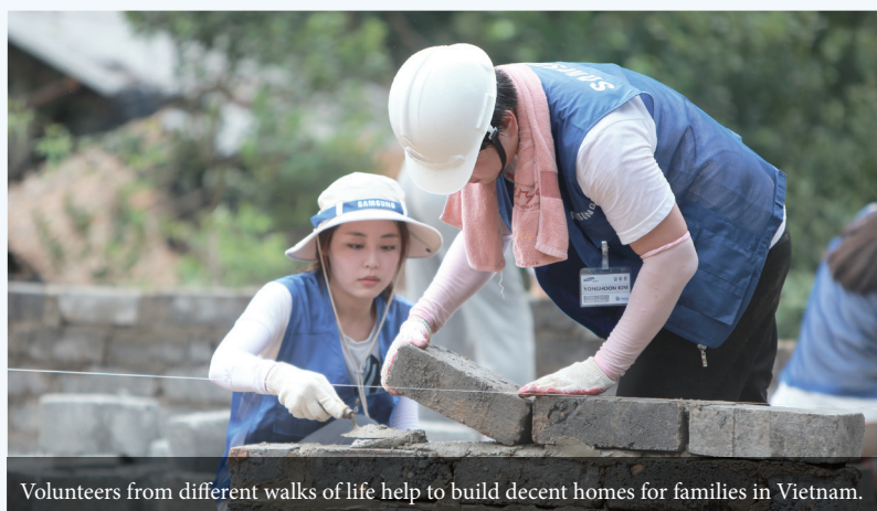
Volunteers from different walks of life help to build decent homes for families in Vietnam.

HFH Vietnam partners with low-income families to build, repair or upgrade their homes with families contributing "sweat equity" or their own labor, and typically repaying the costs through microfinance loans. International volunteers provide a hand-up by building alongside the families. Habitat also enables families to build facilities for clean water and safe sanitation according to their needs. The partner organizations that Habitat works with include the local government and communities. The training that Habitat offers to its partners include appropriate construction technology, financial management, awareness and practice of proper hygiene, community-based disaster risk management.