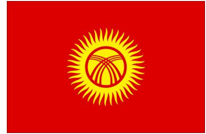
Flag of Kyrgyzstan

Kyrgyzstan is a country of breathtaking natural beauty and proud nomadic traditions. It has some of the highest mountains, largest mountain lakes and most remote and untouched wilderness in the world. Kyrgyzstan is located in Central Asia that is dominated by the Tien Shan, Pamir, and Alay ranges, with an average elevation of 2,750 m above sea level. Kyrgyzstan shares borders with China, Kazakhstan, Uzbekistan and Tajikistan.