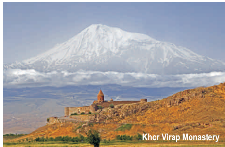
Khor Virap Monastery