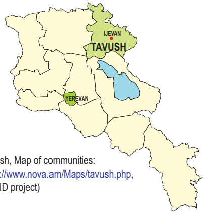
Tavush, Map of communities: ( http://www.nova.am/Maps/tavush.php , USAID project)

Tavush region is situated in the north-east of Armenia. The total area of the region is 9% of the territory of Armenia, of which 39% is agricultural land. The region borders with Gegharkunik and Kotayk regions in the south, Lori in the west, Georgia in the north and Azerbaijan in the east. Tavush region has a 400-kilometer very difficult section of the state border, of which 352 km are with Azerbaijan. Tavush region has a territory of 2,170 sq. kilometers. The region has 5 urban and 57 rural communities, of which 43 are recognized as bordering communities. The population is 134,200, including 52,600 urban dwellers. The economically active population is estimated at 53,500.