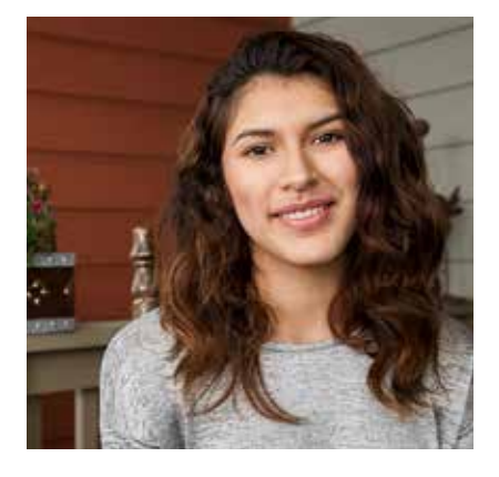
FACES OF HABITAT Meet – and be inspired by – these fellow members of the Habitat family.