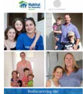
Great Australian Dream Addressing intergenerational poverty

Commissioned by Habitat Australia, the report "Rediscovering the Great Australian Dream" addresses the urgent need to improve homeownership for families with low incomes. While public