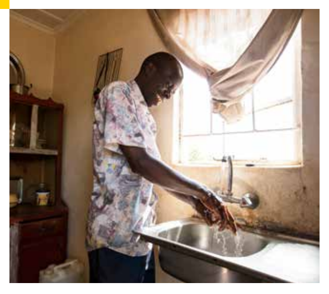
Gastin lives in a Habitat home with running water, rare in Zambia since many families can't afford to connect to the water utility network.

Kiosks are an option for communities that can link to existing water pipes. For those that can't, community water pumps are an answer.