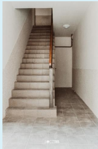
The entrance corridor of the tenement building – after.