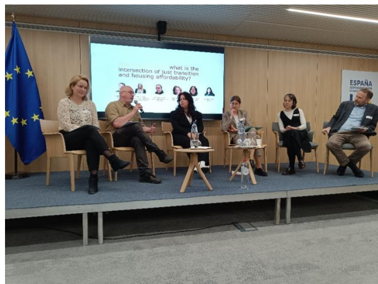
Panel discussion on what is the intersection of Just Transition and housing affordability at the JUSTEM project Final Conference.