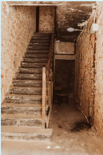
The entrance corridor of the tenement building – before.