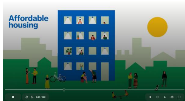
Snapshots from our ESTHer promotional video that will be soon disseminated.