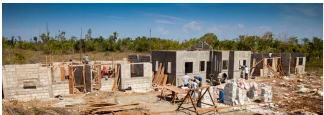
A housing project in the Philippines.

Ownership by 'adverse possession' is further along the continuum than occupancy toward formal land rights because it converts de facto secure tenure into legal tenure. Ownership by adverse possession can be claimed in jurisdictions when the law stipulates that occupation of a piece of land for a minimum period of time (e.g., five years) without being evicted, charged rent or challenged over ownership, together with payment of land tax, confers the de facto right to ownership. In urban settings, it is extremely difficult for individual households to make use of this legal protection, but has proven possible when taken on by well-organized and well-supported communities.