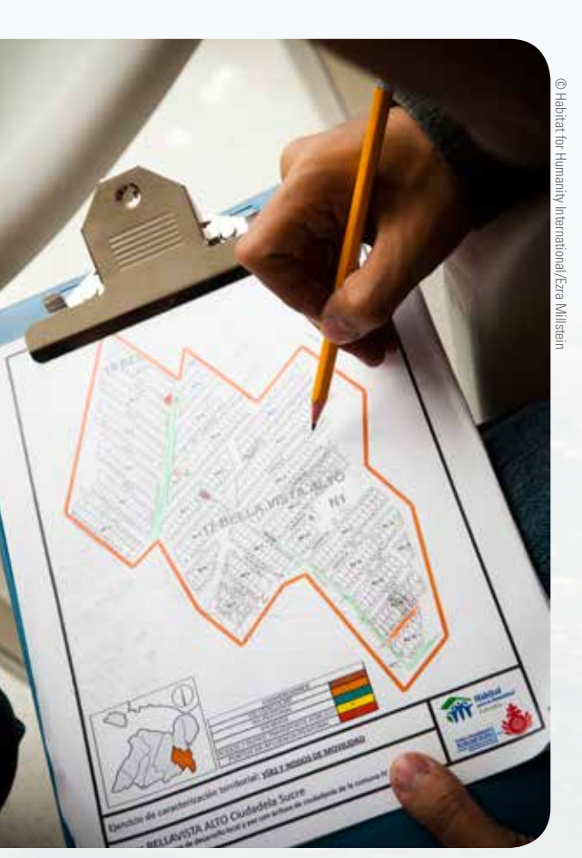
Build Louder volunteers from Latin America and the Caribbean conducted a housing survey in Soacha, Colombia, before the first Regional Forum on Adequate Housing held in Colombia's capital, Bogota.

need for sustainable human settlements during a time of rapid urbanization in the developing world. Conference attendees, including representatives of U.N. member states, civil society, regional and local governments, academia, donors, and the private sector, should take advantage of this key opportunity to produce concrete, actionable steps toward securing land rights for women in the developing world.