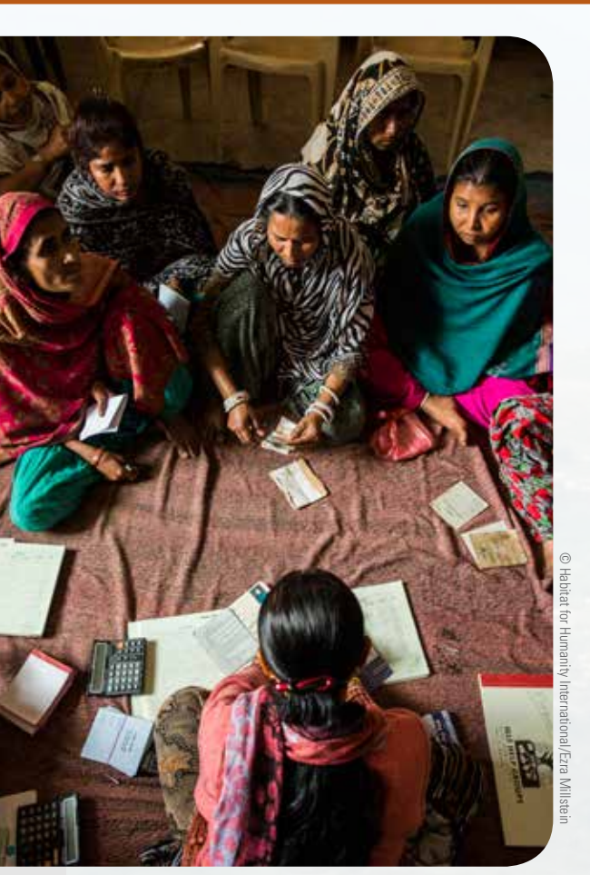
A women's support group meets at the office of Chetanalaya, a community development NGO that partners with Habitat in Bawana, India.